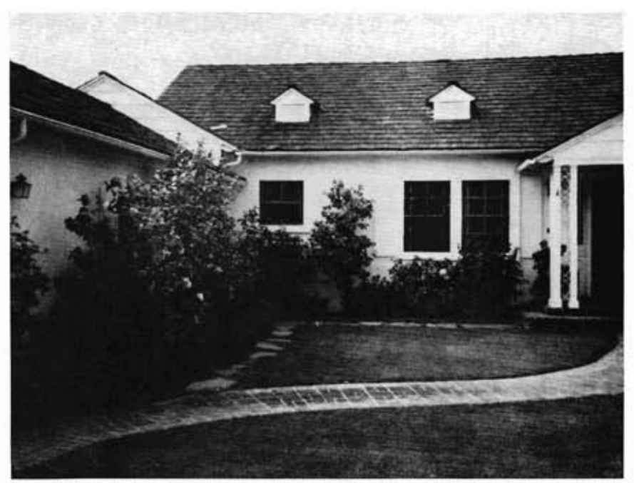
Some of these plants in the Goertz front garden are grafts of newer varieties on the older varieties originally planted.