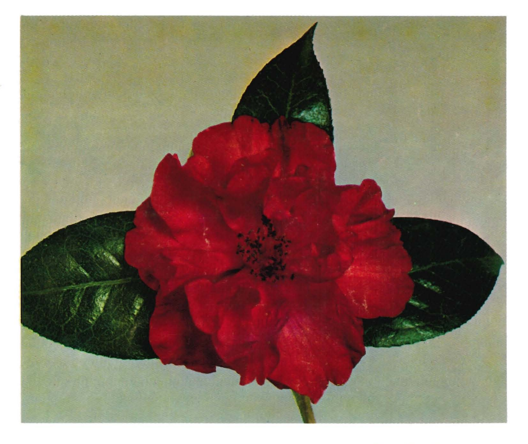
'Fire Chief'

A Publication of the Southern California Camellia Society