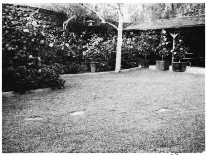
Quality rather than quantity of varieties explains how both lawn and camellias can be grown attractively in a small garden, with good results at camellia shows.