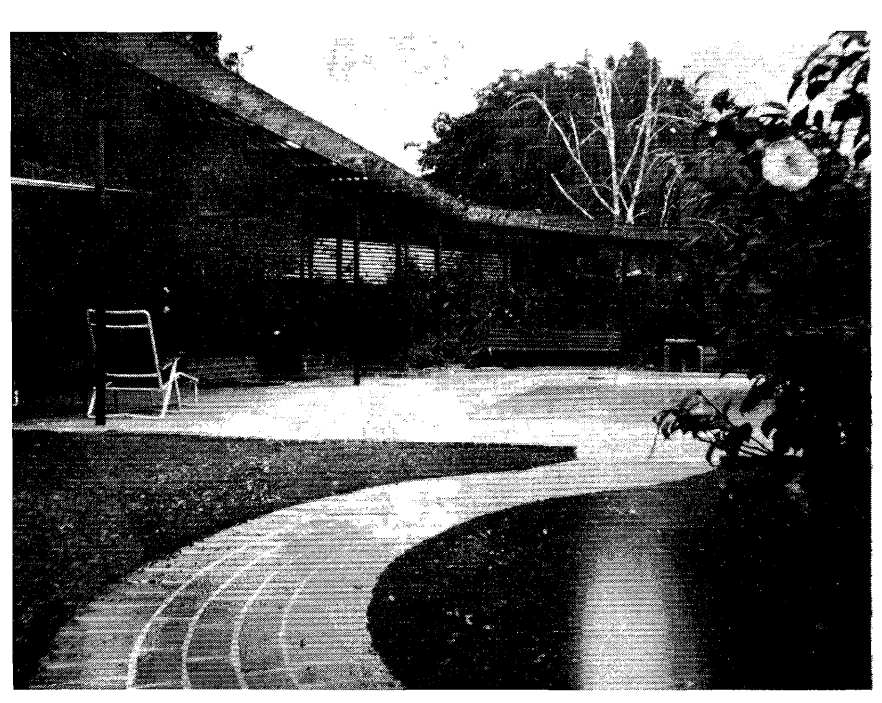
The Pitkin camellia garden has a swimming pool as a center of interest.

Both of these families purchased homes with camellias in the gardens, planted for the landscaping effect rather than for particular blooms; in fact, both gardens were planted before most of the present day popular show varieties had been introduced. When they became camellia enthusiasts. however, and conscious of the varieties that are popular in camellia shows, the older varieties in many cases became the root stock for newer varieties. The result was large plants of varieties that in some cases have not vet attained that size for other people through the normal growth from gallon cans.